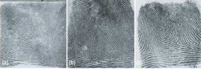
Fig. 1. Three fingerprint types: (a) arch (b) loop (c) whorl [12]