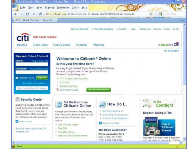
Fig. 3. Logon page of an Internet banking system with embedded myImage on the menu-bar generated by ADSI

We can receive the message when the browser makes any request by using a function window.addEventListener(). When the mozilla makes a https request, the location of the button myImage is replaced, and the image is changed. These behaviors are written into browserinternal JavaScript code, which is read by the XUL