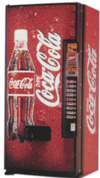
Figure 1: A Finite State Machine with Output.

Call the states (S_0, S_{25}, S_{50}, S_{75}) , with S_0 meaning 'no quarters currently in the machine', S_{25} - 'exactly one quarter in the machine',